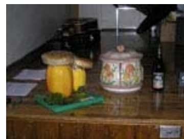
Memories of the SVIMS Survivors Banquet

Visit: www.fungiphoto.com/Treasurechest/MIT/mit