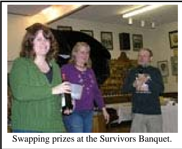
Swapping prizes at the Survivors Banquet.

We use salts and sugars, we sterilize and freeze, we distill with heat or frost, we use several bacteria, we smoke and brine. And we dry fruits, meats, and mushrooms. Drying preserves many mushrooms perfectly well, sometimes even enhances their flavour. Drying has many advantages: storage needs less space, no cooling energy is needed, no special bulky containers are necessary, any amount can be removed for cooking, no